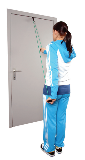
Up and Down Facing the Door