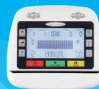
Standard Console (9" LCD)