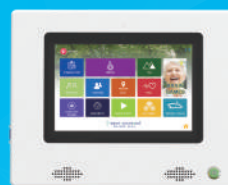
Smart Console (10.1" TFT LCD)